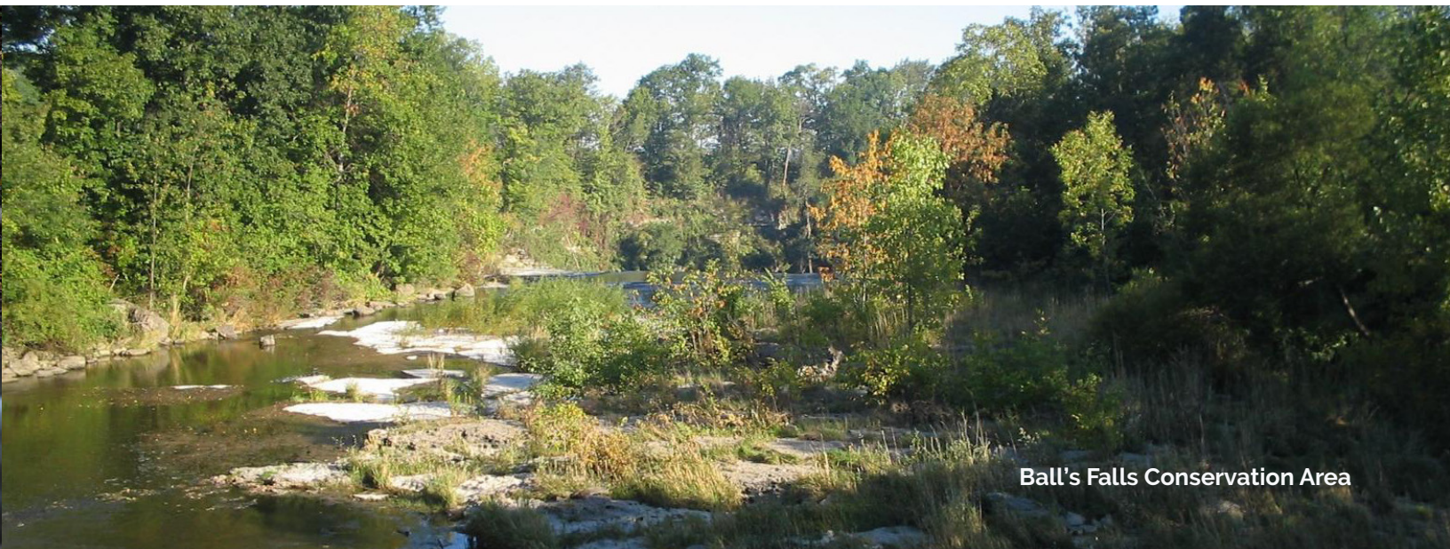
Ball's Falls Conservation Area