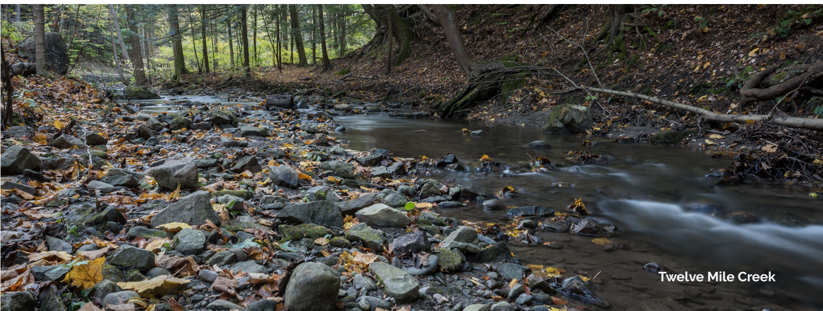
Twelve Mile Creek