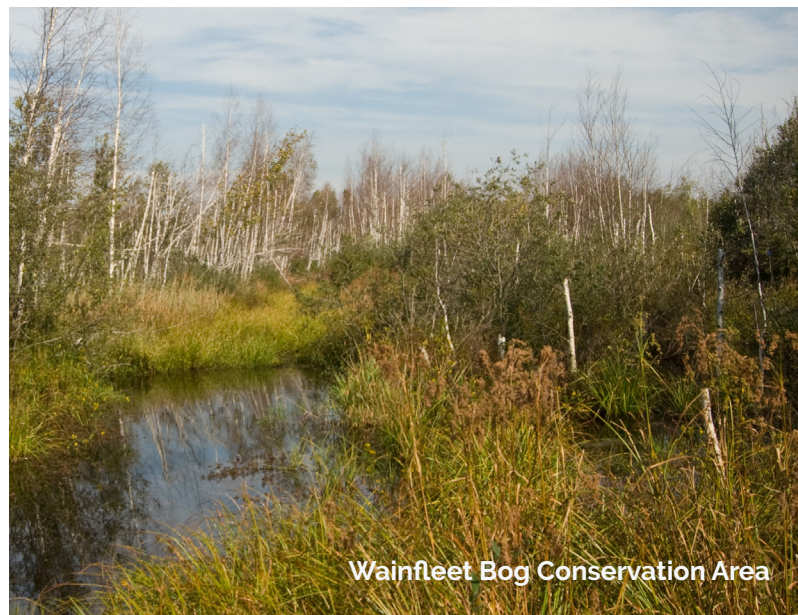
Wainfleet Bog Conservation Area