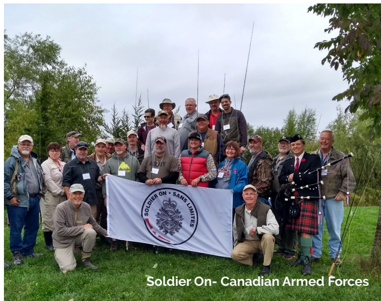
Soldier On- Canadian Armed Forces