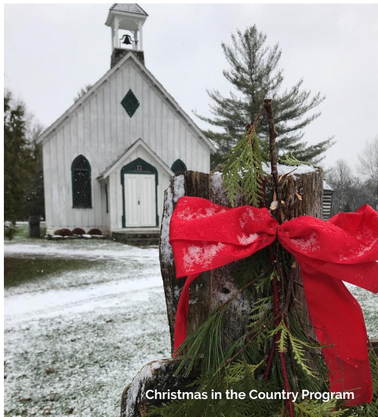
Christmas in the Country Program