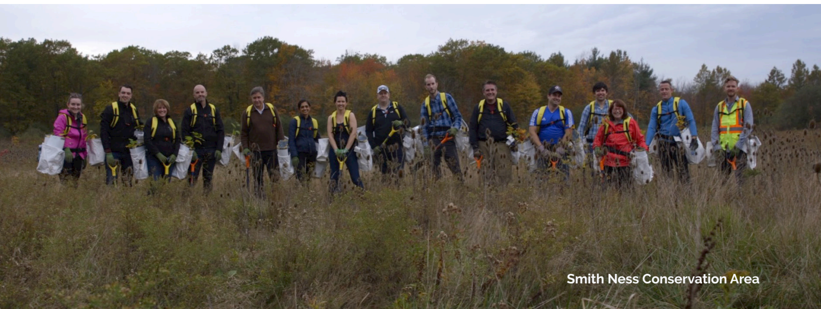
Smith Ness Conservation Area