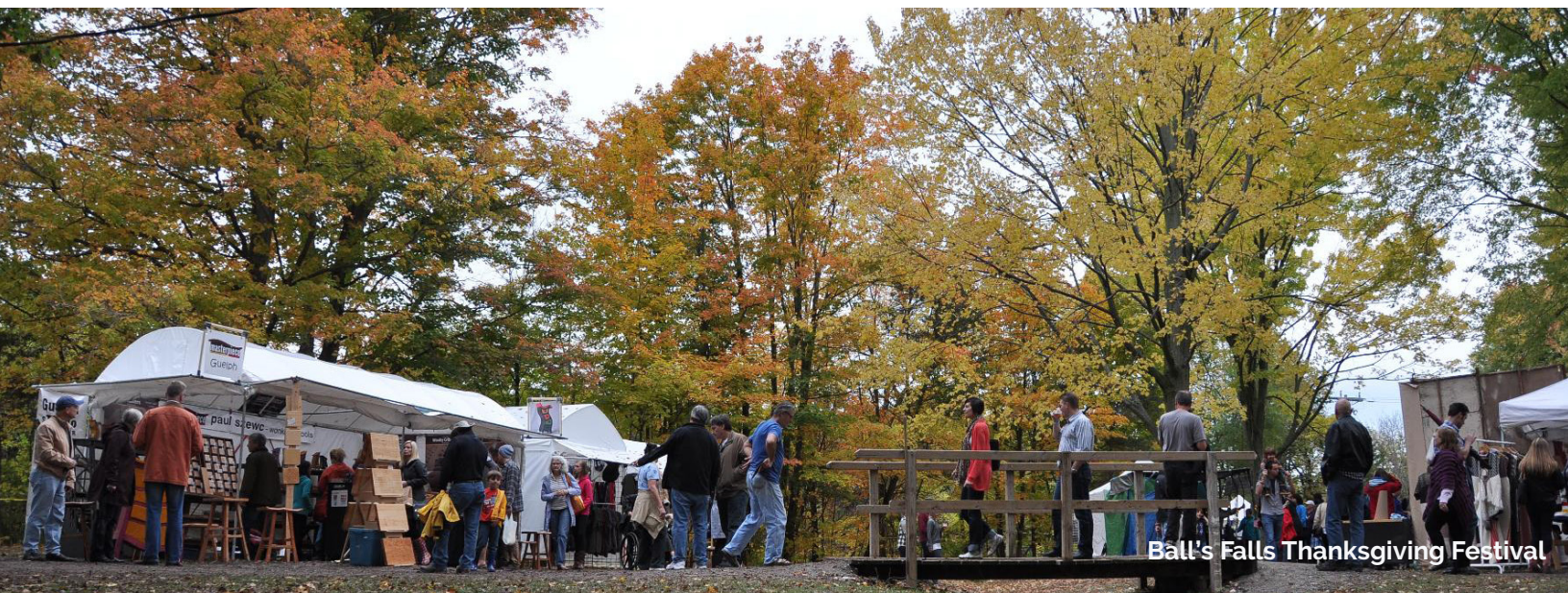
Ball's Falls Thanksgiving Festival