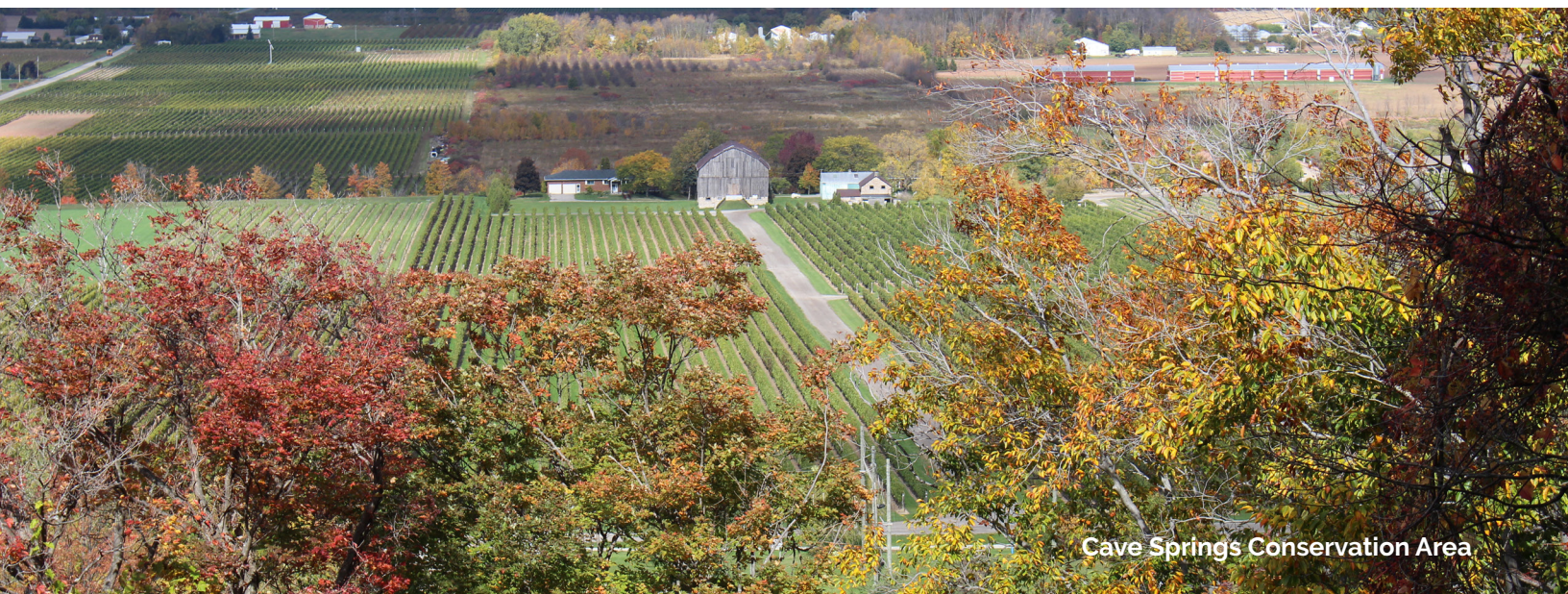
Cave Springs Conservation Area