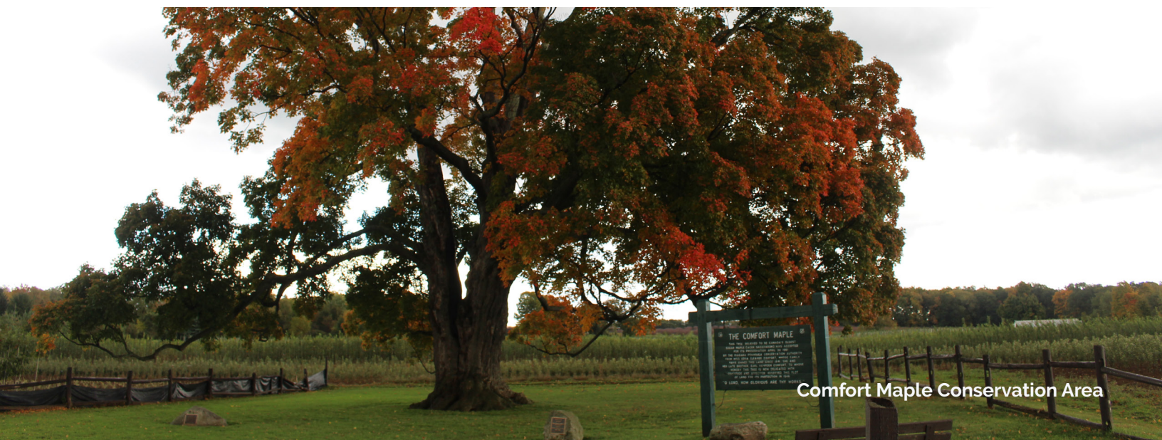
Comfort Maple Conservation Area