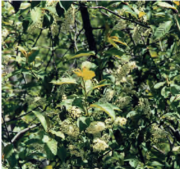
Robert Ritchie, Niagara Parks Commission

Meadowsweet is found in bogs, savannas, dunes, old fields, streambanks, wet thickets and roadside ditches. This species should be planted in full sun, as it is intolerant of shade. It can be planted where there is very poor to moderately poor drainage. Meadowsweet is resistant to drought and tolerant of flooding, but it is sensitive to salt.