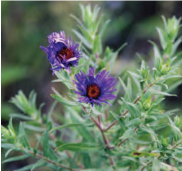
Robert Ritchie, Niagara Parks Commission

New England Aster is found in moist rich fields and wet meadows, swamps and along shorelines. It prefers areas that are more often moist than dry, therefore this flower should be planted in relatively open areas with moderate to poor drainage.