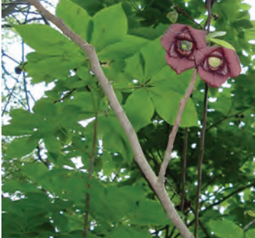
Eddie Jones, photographer