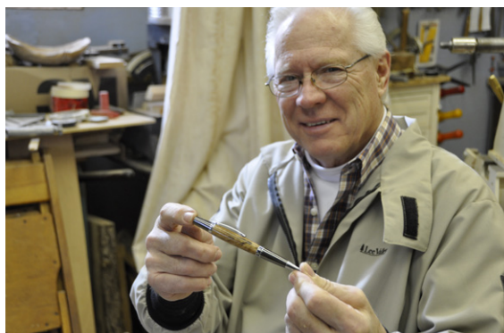
COMFORT MAPLE PENS MARV ENS