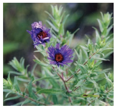
Robert Ritchie, Niagara Parks Commission

New England Aster is found in moist rich fields and wet meadows, swamps and along shorelines. It prefers areas that are more often moist than dry, therefore this flower should be planted in relatively open areas with moderate to poor drainage.