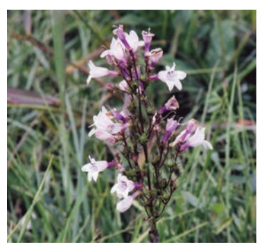
Robert Ritchie, Niagara Parks Commission

Foxglove Beardtongue is found in old fields, wet meadows, open woodlands or along the edges of woods. It should be planted in full to partial sun where there is moderate drainage.