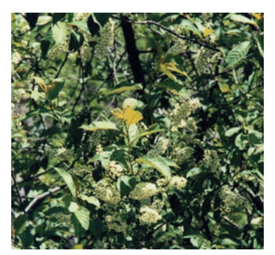
Robert Ritchie, Niagara Parks Commission

Meadowsweet is found in bogs, savannas, dunes, old fields, streambanks, wet thickets and roadside ditches. This species should be planted in full sun, as it is intolerant of shade. It can be planted where there is very poor to moderately poor drainage. Meadowsweet is resistant to drought and tolerant of flooding, but it is sensitive to salt.