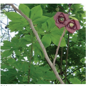
Eddie Jones, photographer