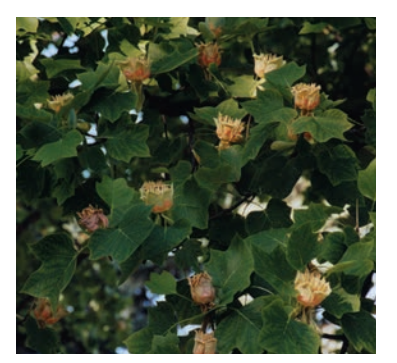
Robert Ritchie, Niagara Parks Commission

The Tulip Tree grows on dry slopes and upland flats with loose, moderately fine sandy soils. They also grow on sandy to medium loams that are well to moderately well-drained. They are very intolerant of flooding and are also sensitive to drought and heat. Once in the sunlight, they grow very quickly. Tulip Trees should be planted in deep, moist, fertile soils and in sun or partial shade.