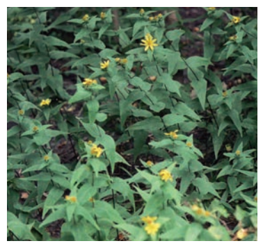
Robert Ritchie, Niagara Parks Commission

Woodland Sunflower is found in dry open forests, thickets, tallgrass woodlands and rock barrens. It should be planted in full to partial sun where there is good to excessive drainage.