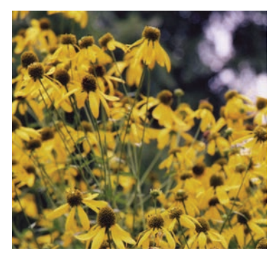
Robert Ritchie, Niagara Parks Commission

Green-headed Coneflower is found in moist, open areas. It should be planted in full to partial sun with moderate to poor drainage.