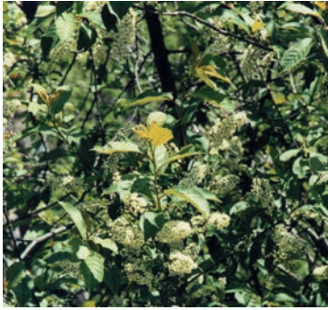
Robert Ritchie, Niagara Parks Commission

Meadowsweet is found in bogs, savannas, dunes, old fields, streambanks, wet thickets and roadside ditches. This species should be planted in full sun, as it is intolerant of shade. It can be planted where there is very poor to moderately poor drainage. Meadowsweet is resistant to drought and tolerant of flooding, but it is sensitive to salt.