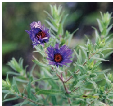
Robert Ritchie, Niagara Parks Commission

New England Aster is found in moist rich fields and wet meadows, swamps and along shorelines. It prefers areas that are more often moist than dry, therefore this flower should be planted in relatively open areas with moderate to poor drainage.