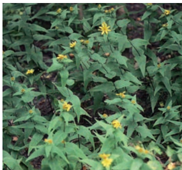
Robert Ritchie, Niagara Parks Commission

Woodland Sunflower is found in dry open forests, thickets, tallgrass woodlands and rock barrens. It should be planted in full to partial sun where there is good to excessive drainage.