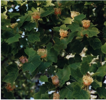
Robert Ritchie, Niagara Parks Commission

The Tulip Tree grows on dry slopes and upland flats with loose, moderately fine sandy soils. They also grow on sandy to medium loams that are well to moderately well-drained. They are very intolerant of flooding and are also sensitive to drought and heat. Once in the sunlight, they grow very quickly. Tulip Trees should be planted in deep, moist, fertile soils and in sun or partial shade.