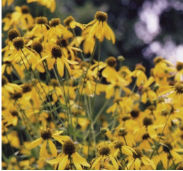
Robert Ritchie, Niagara Parks Commission

Green-headed Coneflower is found in moist, open areas. It should be planted in full to partial sun with moderate to poor drainage.