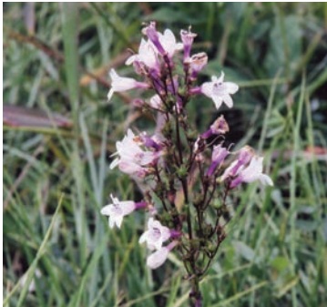
Robert Ritchie, Niagara Parks Commission

Foxglove Beardtongue is found in old fields, wet meadows, open woodlands or along the edges of woods. It should be planted in full to partial sun where there is moderate drainage.